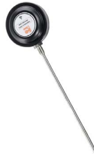
Wireless Temperature Transducers