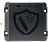
PreView Side Defender ® II