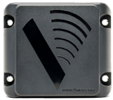
PreView Sentry ®