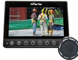
Audible and Visual In-Cab Alerts with PreView Plus