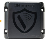
PreView Side Defender ® II