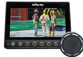
Audible and Visual In-Cab Alerts