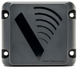
PreView Sentry ®