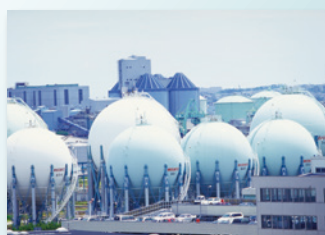
Oil refineries, plants producing basic petrochemical products

Extensive lineup of models for any location!