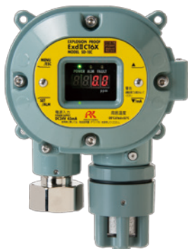
For hydrogen sulfide/carbon monoxide

* Use for gas detection by aspiration requires a suction pump and aspirator unit (available separately), in addition to a power supply.