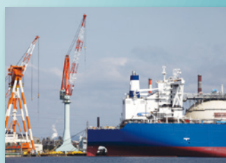
Shipping and offshore facilities