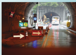
Service and utility tunnels, construction sites